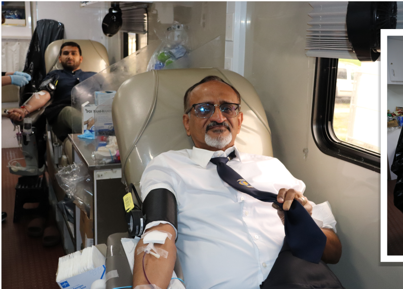
Photo album is available at NJ Branch Home page - www.nirankari.org/newjersey