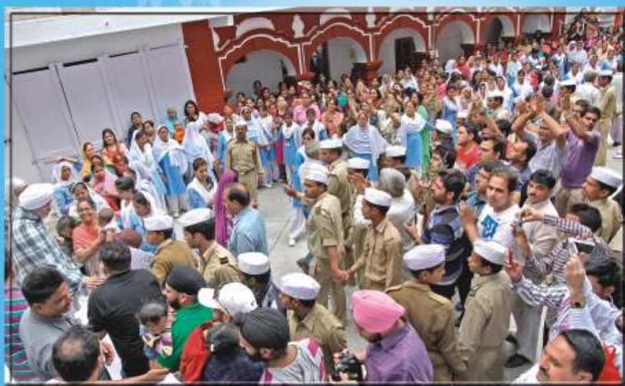
Huge gathering of devotees seeking blessings of Satguru Babaji in Mussoorie (Uttarakhand)