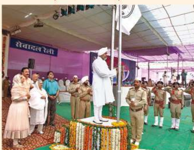
Day 2: Sewadal Rally