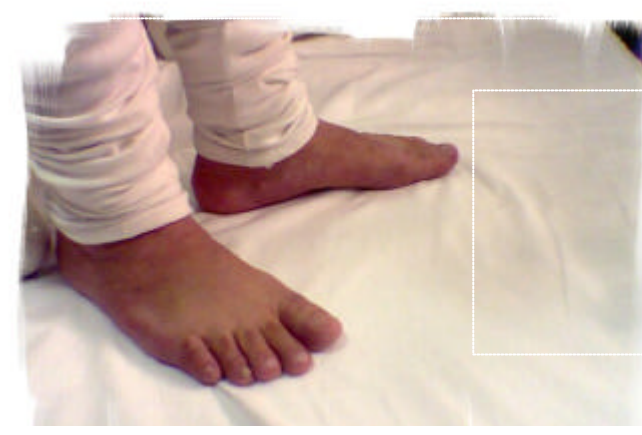
To give yourself at His feet, Humble your mind, Your physical, All that you have reaped